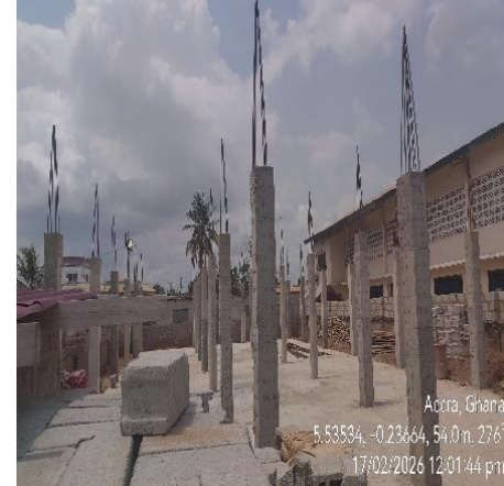
Accra, Ghana 5.53534, -0.23664, 54.0m, 276° 17/02/2026 12:01:44 pm