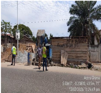
Accra Ghana 5.53657, -0.23833, 43.5m, 71° 13/02/2026 11:24:49 am