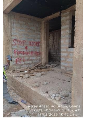
Sackey Ansah Rd, Accra, Ghana 5.52731, -0.24859, 31.4m, 47° 17/02/2026 10:42:29 am