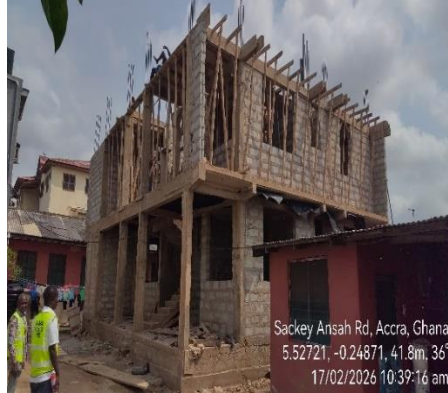
Sackey Ansah Rd, Accra, Ghana 5.52721, -0.24871, 41.8m, 36° 17/02/2026 10:39:16 am