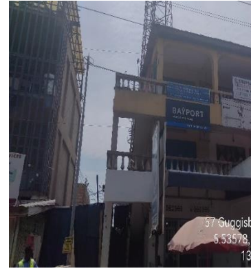
57 Gugigib 5.53578, 13