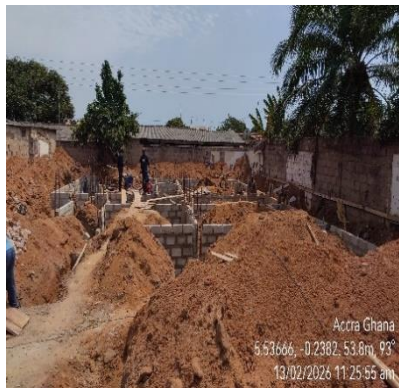
Accra Ghana 5.53666, -0.2382, 53.8m, 93° 13/02/2026 11:25:55 am