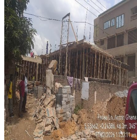
Fanaa Ln, Accra, Ghana 5.53662, -0.24386, 46.3m, 345° 17/02/2026 11:32:11 am